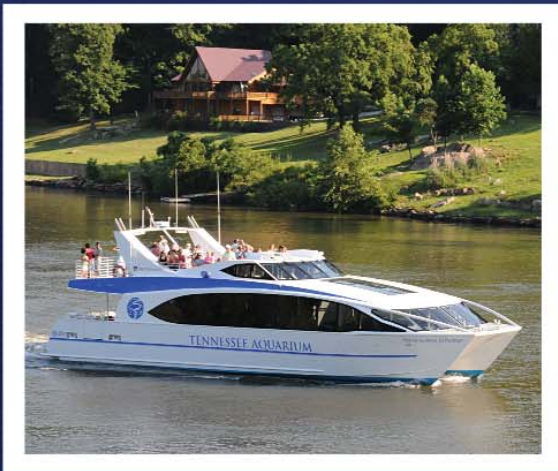
RIVER GORGE EXPLORER