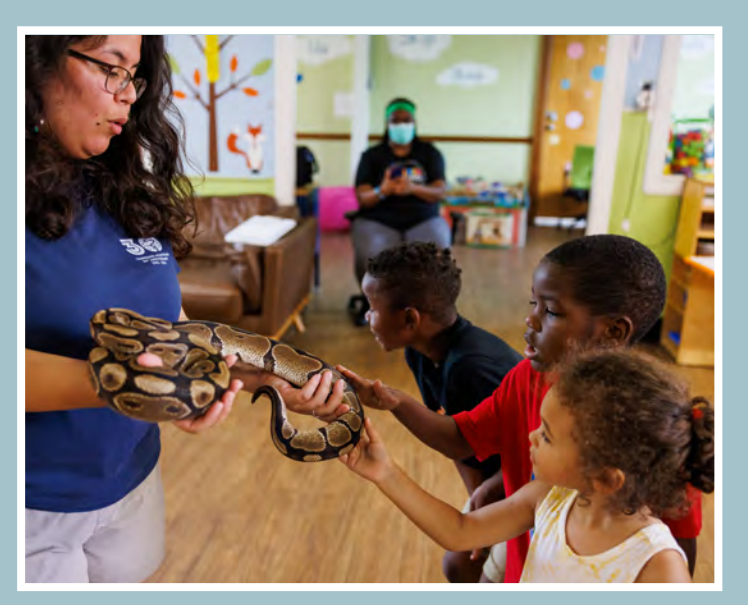
Community Engagement Educator shows an ambassador animal during an education outreach program